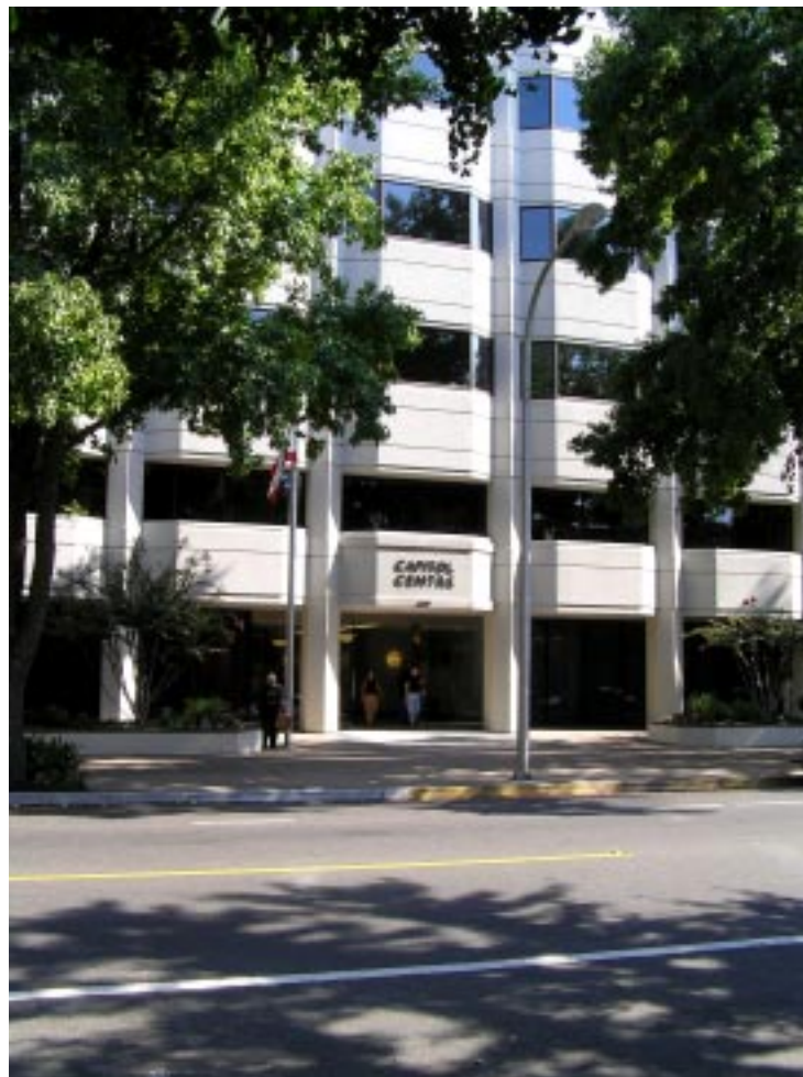
- The Department's Sacramento Office